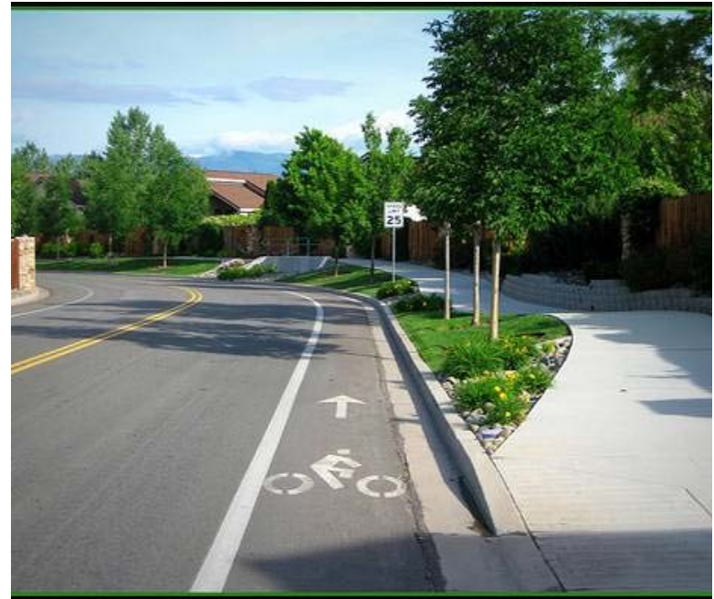
One-way bicycle lane on each side of road, sidewalk present, tree-lined terrace