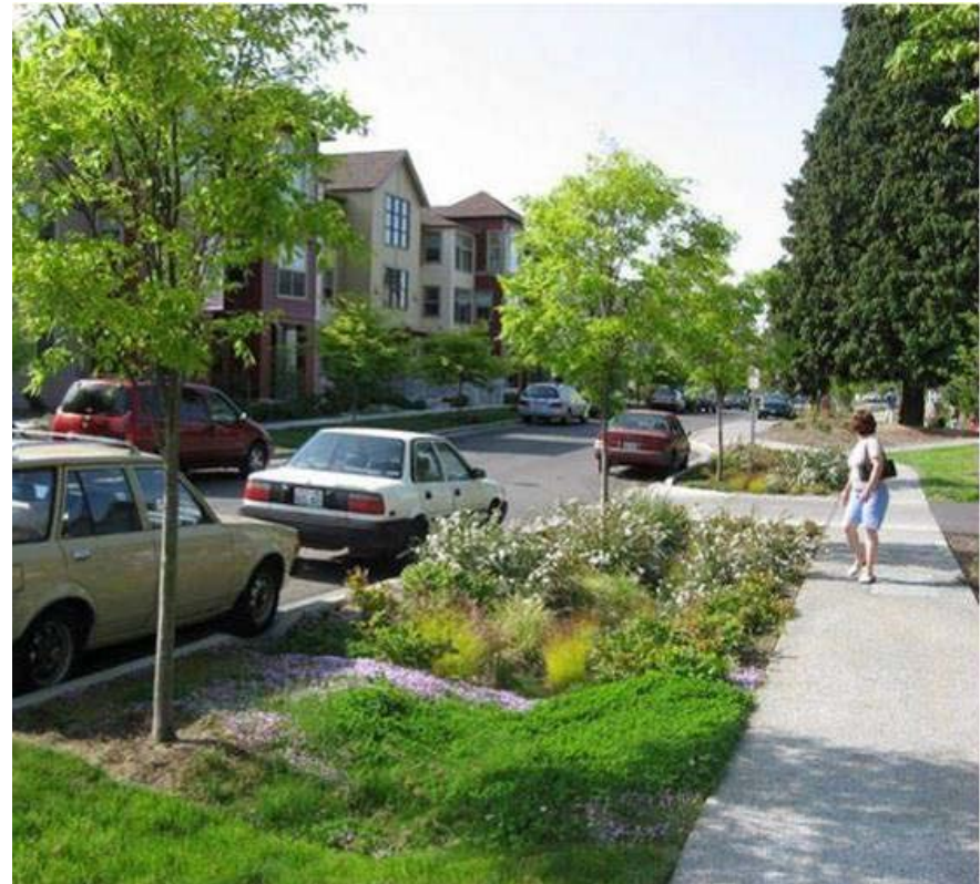
12 foot terrace, tree lined, natural and attractive bioswale stormwater filter plantings, sidewalk