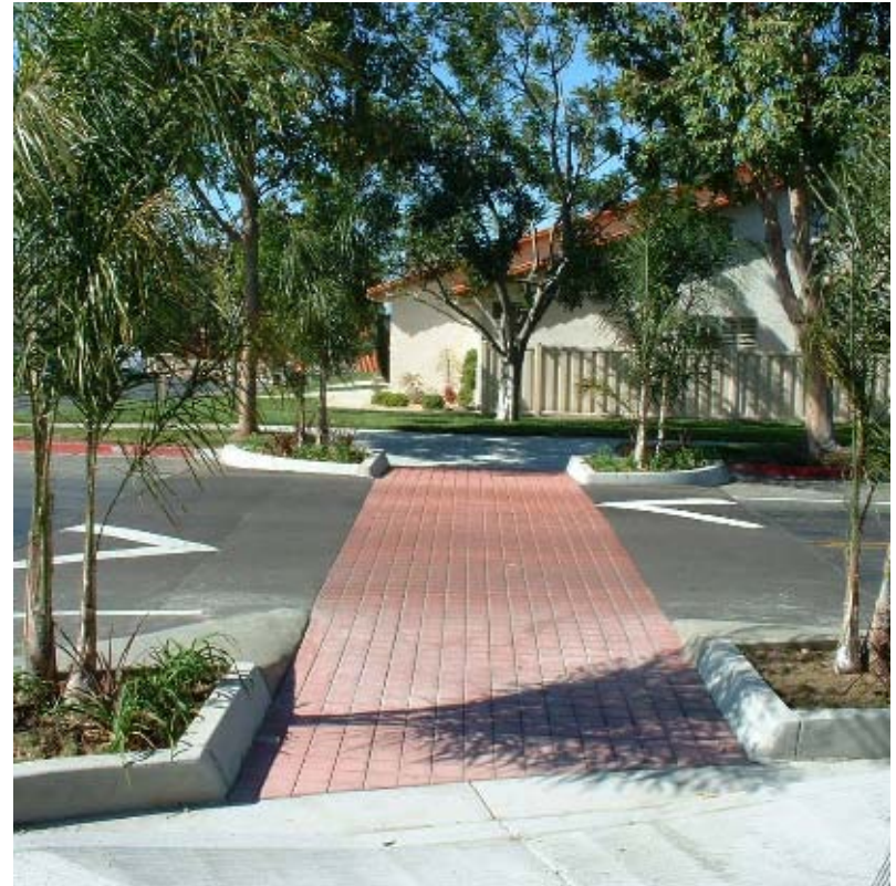
Raised crosswalks with clear markings greatly improves safety.